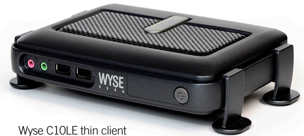
Wyse C10LE thin client

Wyse Technology Inc. 3471 North First Street San Jose, CA 95134-1801